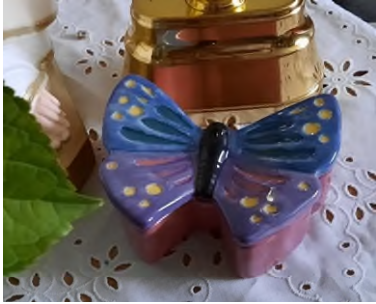
1Butterfly box painted on vacation